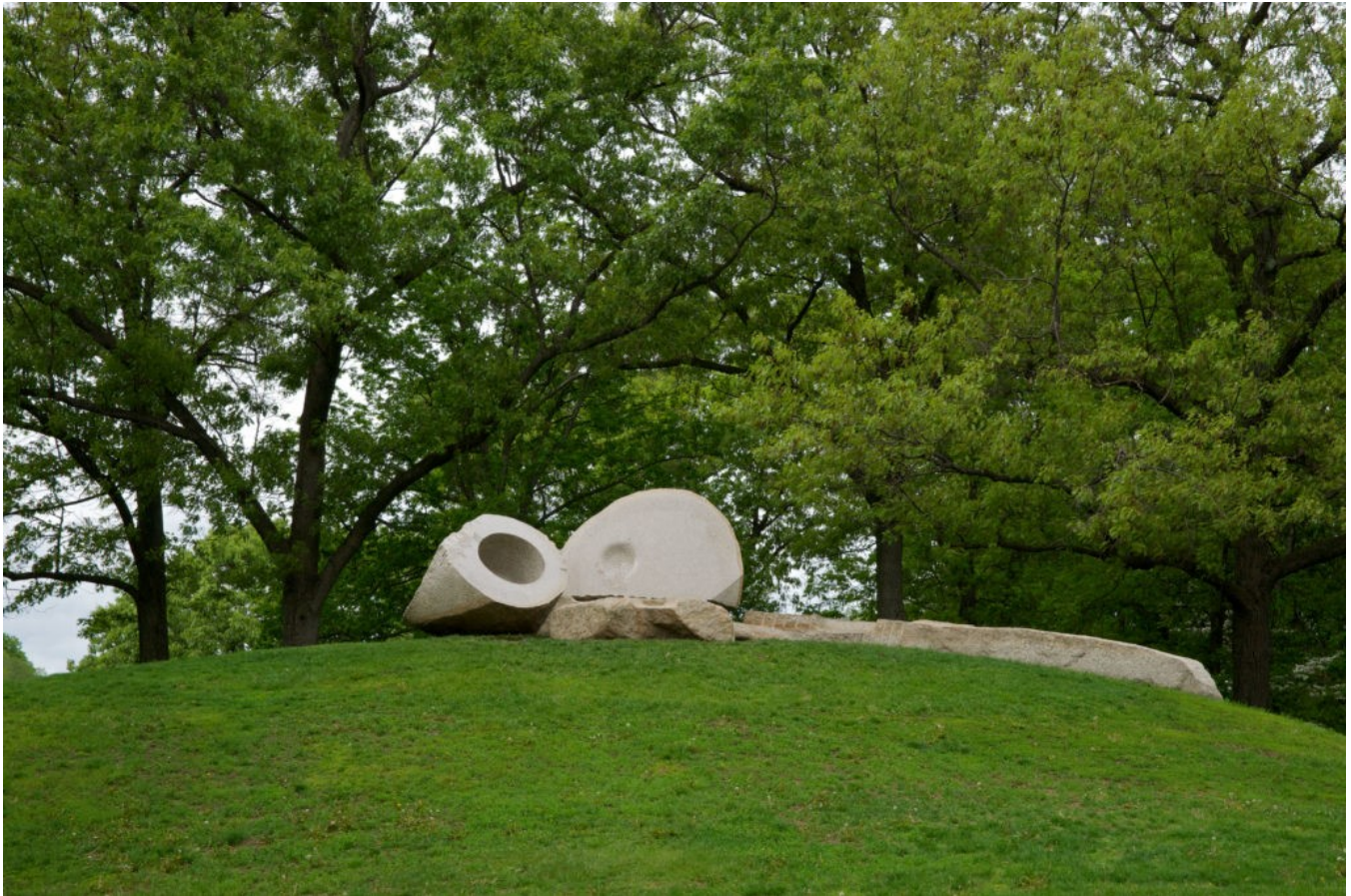
Isamu Noguchi (American, born Japan, 1904–1988), Momo Taro , 1977–78. Granite, 9 ft. x 34 ft. 7 in. x 21 ft. 7 in. (274.3 cm x 10.5 m x 657.9 cm). Gift of the Ralph E. Ogden Foundation. © 2017 The Isamu Noguchi Foundation and Garden Museum, New York/ Artists Rights Society (ARS), New York