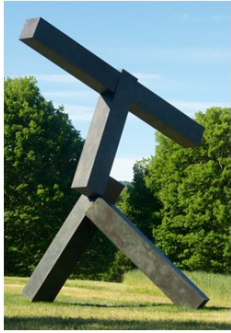
Artwork: Untitled (1994) by Joel Shapiro

Visit some or all of the artworks featured in this resource packet: