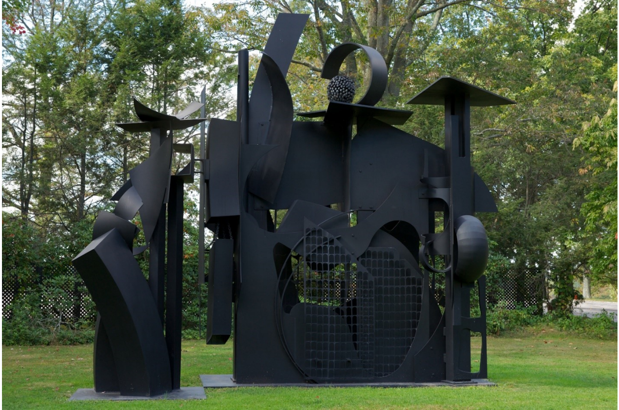
Louise Nevelson (American, born Russia, 1899–1988), City on the High Mountain , 1983. Painted steel, 20 ft. 6 in. x 23 ft. x 13 ft. 6 in. (624.8 x 701 x 411.5 cm). Purchase Fund. © 2017 Estate of Louise Nevelson/ Artists Rights Society (ARS), New York