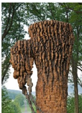
Artworks: Luba (2009–10) and For Paul (1990–92/2001) by Ursula von Rydingsvard

Engagement: View from multiple angles. Ask students what they notice about the artwork in person, which they did not notice when viewing a photo of it in class. Ask younger students to recreate the form with their bodies. Invite older students to sketch or photograph from multiple angles. The artist described this sculpture as having “a lot of energy.” What do students see that might relate to the idea of energy?