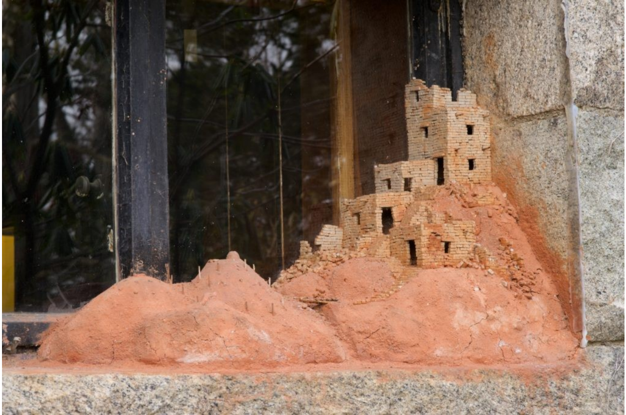
Charles Simonds (American, b. 1945), Dwellings , 1981. Clay, sand, ceramic bricks, and sticks, 13 x 22 1/2 x 10 in. (33 x 57.2 x 25.4 cm). Purchased with the aid of funds from the National Endowment for the Arts and gift of the Ralph E. Ogden Foundation