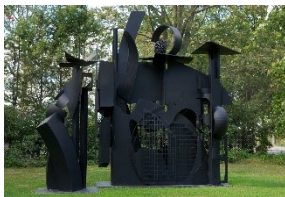
Artworks: City on the High Mountain (1983) by Louise Nevelson and Dwellings (1981) by Charles Simonds

Location: Museum Hill; see map on page 12