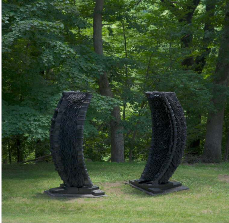
Chakaia Booker (American, b. 1953), A Moment in Time , 2004. Rubber tires, stainless steel, and steel, 10 ft. x 9 ft. 1 in. x 10 ft. 2 in. (304.8 x 276.9 x 309.9 cm). Gift of the Horace W. Goldsmith Foundation