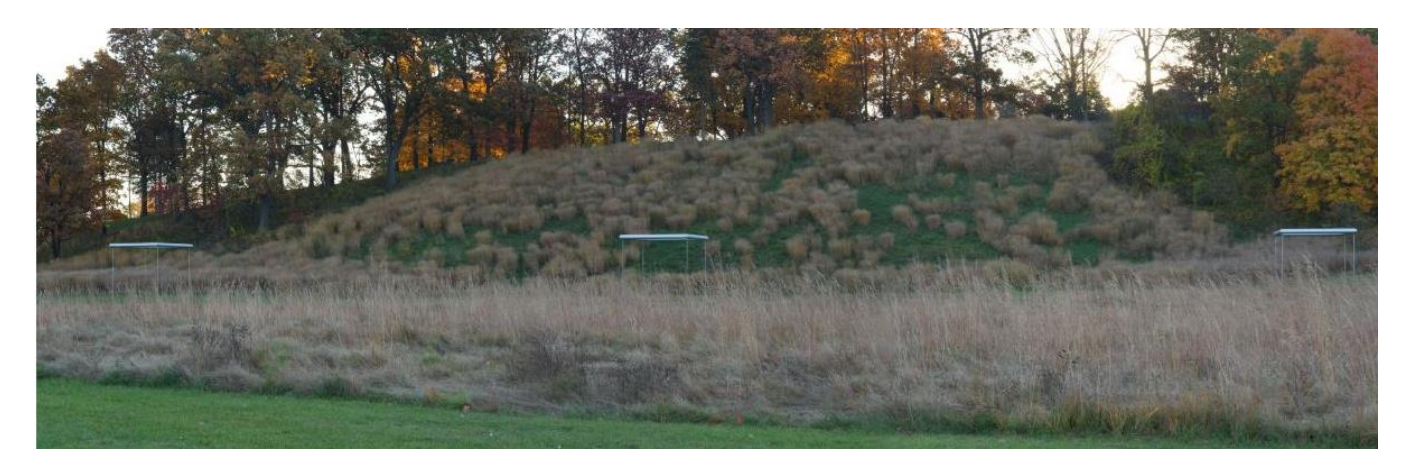
David von Schlegell (American, 1920–1992). Untitled, 1972. Aluminum and stainless steel, 20 ft. x 25 ft. 4 in. x 16 ft. (609.6 x 772.2 x 487.7 cm. Purchased with the aid of funds from the National Endowment for the Arts and gift of the Ralph E. Ogden Foundation. ©Estate of David von Schlegell.