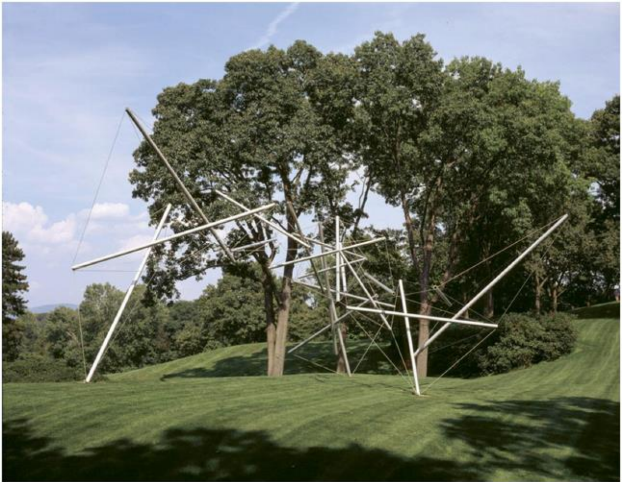
Kenneth Snelson (American, 1927–2016), Free Ride Home , 1974. Aluminum and stainless steel, 30 ft. x 60 ft. x 60 ft. (914.4 cm x 18.3 m x 18.3 m). Gift of the Ralph E. Ogden Foundation.