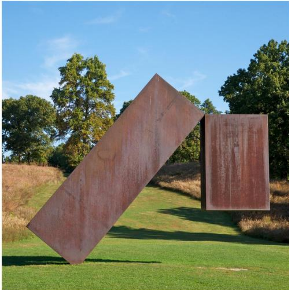
Menashe Kadishman (Israeli, 1932–2015), Suspended , 1977. Weathering steel, 23 ft. x 33 ft. x 48 in. (701 cm x 10.1 m x 121.9 cm). Gift of Muriel and Philip I. Berman, Allentown, PA. © Menashe Kadishman