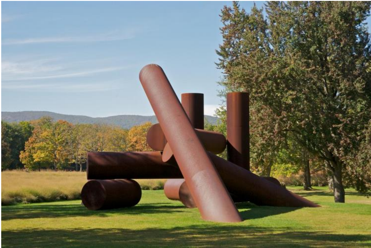
Alexander Liberman (American, born Russia, 1912–1999). Adonai , 1970–71 (refabricated 2000). Steel, 29 ft. 6 in. x 63 ft. x 52 ft. 8 in. (899.2 cm x 19.2 m x 16.1 m). Gift of the Ralph E. Ogden Foundation. © The Alexander Liberman Trust. Photo by Jerry L. Thompson