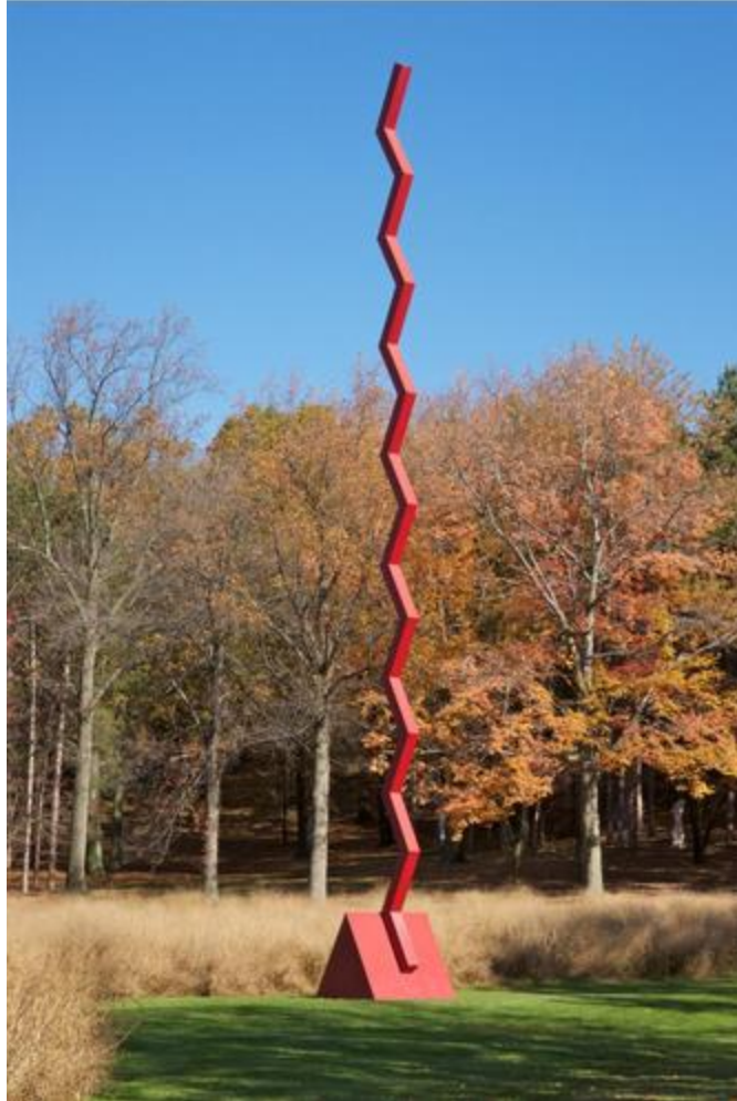
Tal Streeter (American, 1934–2014). Endless Column , 1968. Painted steel, 69 ft. 4 in. x 7 ft. 10 in. x 7 ft. 6 in. (21.1 m x 238.8 cm x 228.6 cm). Purchased with the aid of funds from the National Endowment for the Arts and gift of the Ralph E. Ogden Foundation.